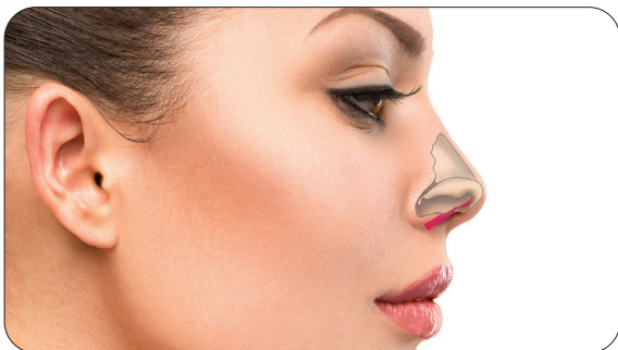
Figure 1: COLUMELLAR STRUT

Profile's pre-cut form requires little intraoperative manipulation for use as a columellar strut (Figure 1), spreader grafts or dorsal on-lay graft. Surgeons commonly use one or more of these grafts in rhinoplasty procedures.