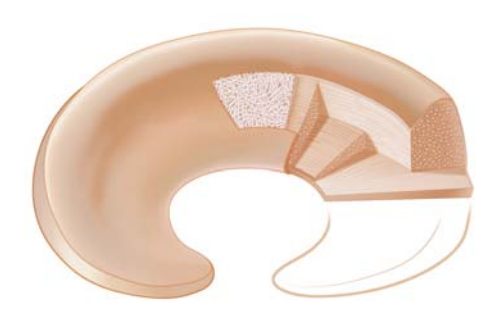
Circumferentially and longitudinally arranged collagen fibers in the meniscus.<sup>3</sup>

ConMed Linvatec 11311 Concept Boulevard Largo, FL 33773-4908 800.237.0169 • Fax 727.399.5256 To order call 800.433.6576 or +1.732.661.0202 www.linvatec.com