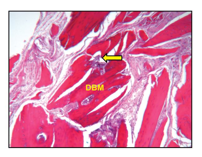
Figure 1: InterGro DBM Putty. H&E stain; 40X magnification; BAR = 250 µm. New bone formation with marrow (arrow) and residual DBM associated with new bone.